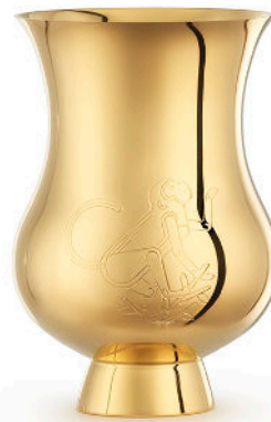
Monkey tumbler 4028410 sterling silver 4028420 gold gilt