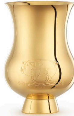
Pig tumbler 4028710 sterling silver 4028720 gold gilt

Ø 6,5 x H. 10 cm | 30 cl Ø 2.6 x H. 3.9 in | 10.6 fl oz