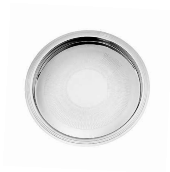
plateau rond round tray