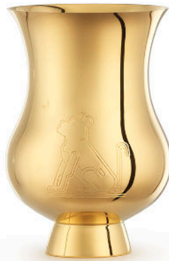
Dog tumbler 4028610 sterling silver 4028620 gold gilt