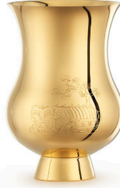
Tiger tumbler 4027810 sterling silver 4027820 gold gilt