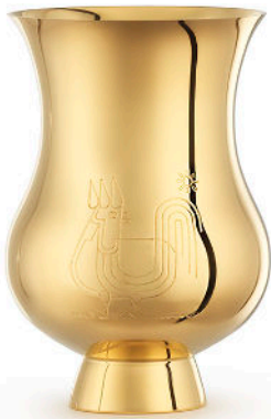
Rooster tumbler 4028510 sterling silver 4028520 gold gilt