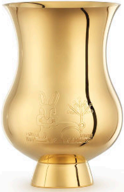
Rabbit tumbler 4027910 sterling silver 4027920 gold gilt