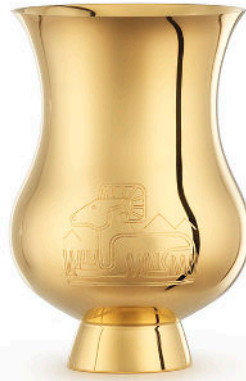
Goat tumbler 4028310 sterling silver 4028320 gold gilt