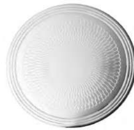
dessous de verre coaster