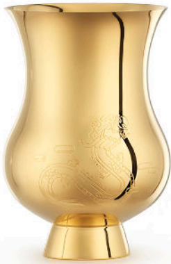
Dragon tumbler 4028010 sterling silver 4028020 gold gilt