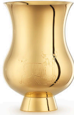
Ox tumbler 4027710 sterling silver 4027720 gold gilt