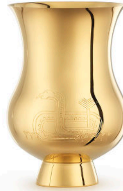
Snake tumbler 4028110 sterling silver 4028120 gold gilt