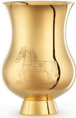
Horse tumbler 4028210 sterling silver 4028220 gold gilt