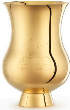
Rat tumbler 4027610 sterling silver 4027620 gold gilt